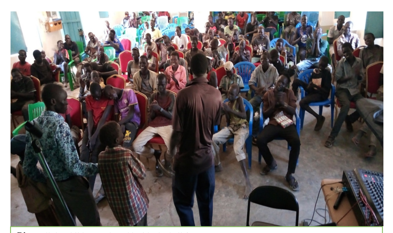
Pic_2 : All the children gathered inside the hall for prayers