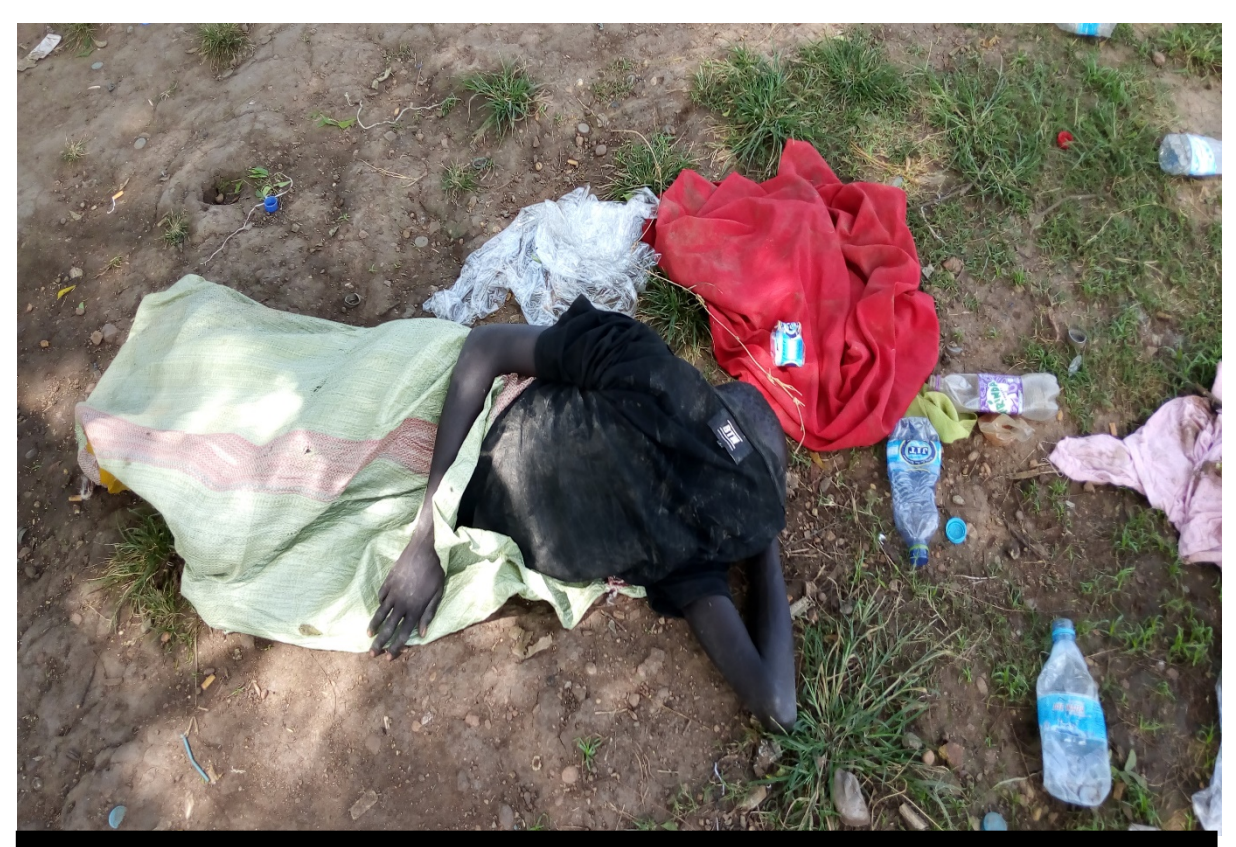
Pic<sub>1</sub>: Most of these children have no place to sleep. They spent their nights on the verandas and isolated places outside the market during day time. This is one of the children starving of hunger. He said both parents were killed and his relatives are not showing him a parental care.

Due to the situations such a loss of parents, parental abuse, alcoholism, youthful rebellion and range of traumas resulting from the war or intercommunal and tribal fighting, many children have become homeless and are vulnerable to social risks and hazards such as substance abuse, theft, and human trafficking. The pictures of starving children are shown below.