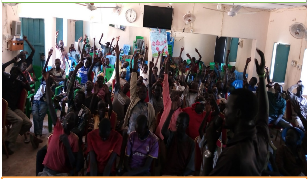
Pic <sub>3</sub>: All the children were praying.