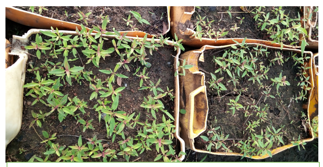
The Eucalyptus seedling have grown and they will be transplanted soon.