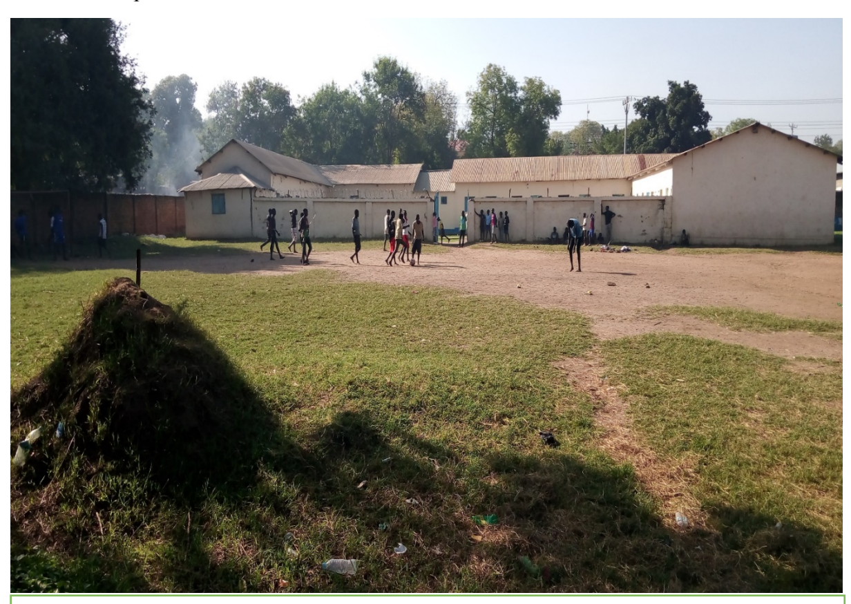
Pic <sub>1</sub>: We started with the sport program and they like it so much.

We are here to express our gratitude for your continued support. Thank you very much for continued supporting the ministry spiritually and financially. We have successfully conducted end of the year gathering with children today. It was a blessed day for us to gathered with the children. The pictures of the event are attached below.