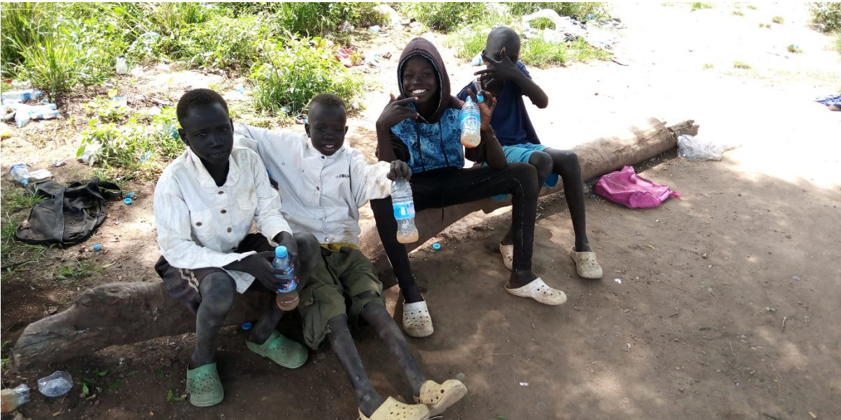
Pic<sub>3</sub>: These children said they have no where to go because they don't know where their parents are. They said they are sleeping on the verandas and continued taking glue to take away the stress from them.